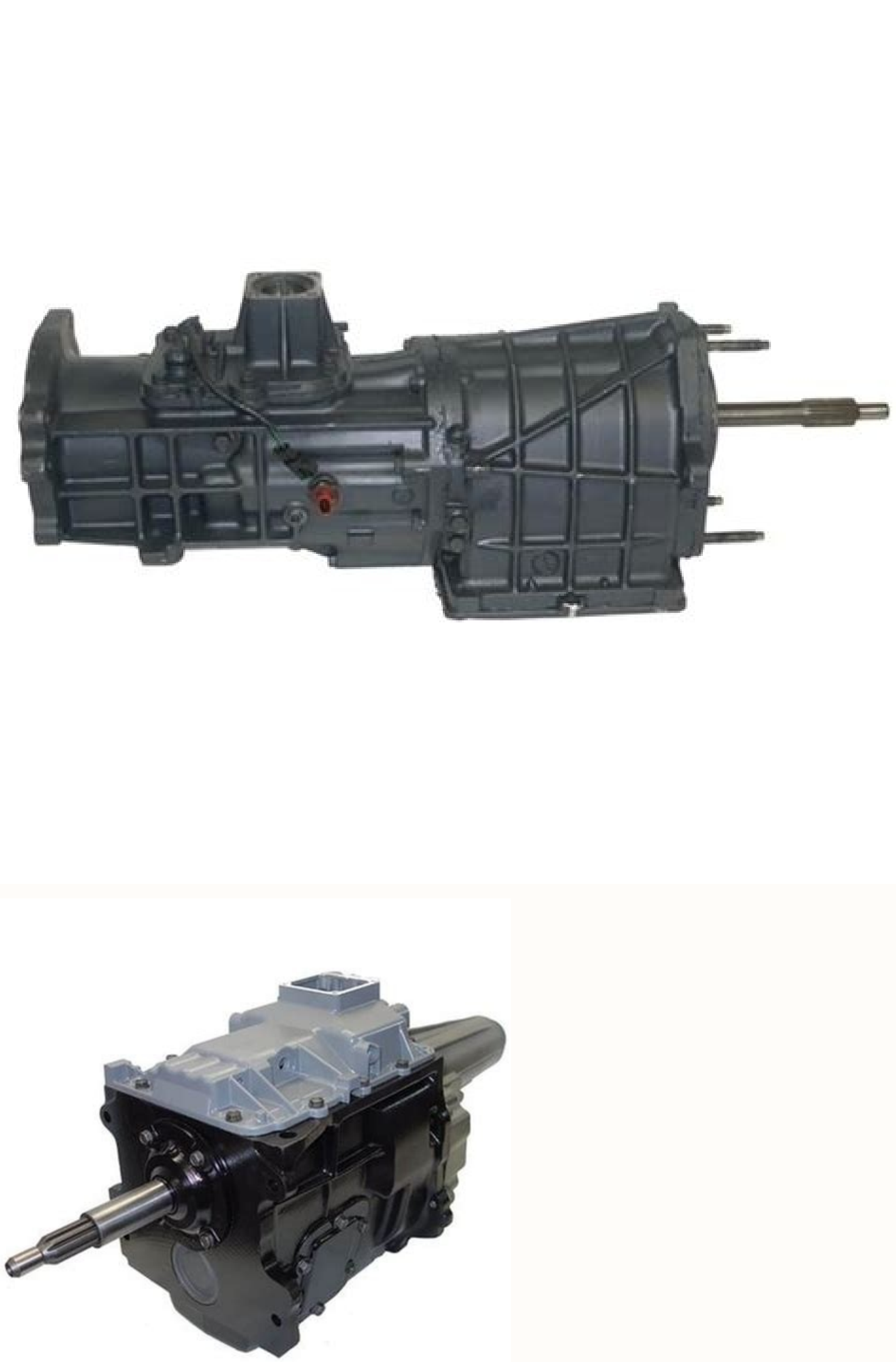
Gearbox problems manual.